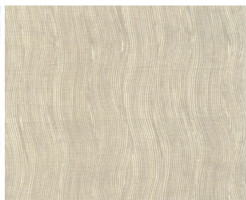
DC7328-SAND BEACH COMBER 1/4 YARD