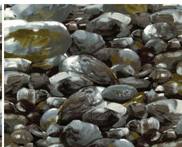
CJ2932-GRAY JUST ROCKS 2-3/4 YARDS (BACKING)