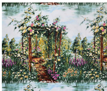
CJ3362-GREEN 2/3 YARD