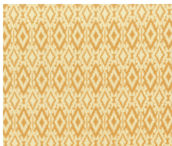
DC7529-SAND TAOS TEXTURE 1/2 YARD